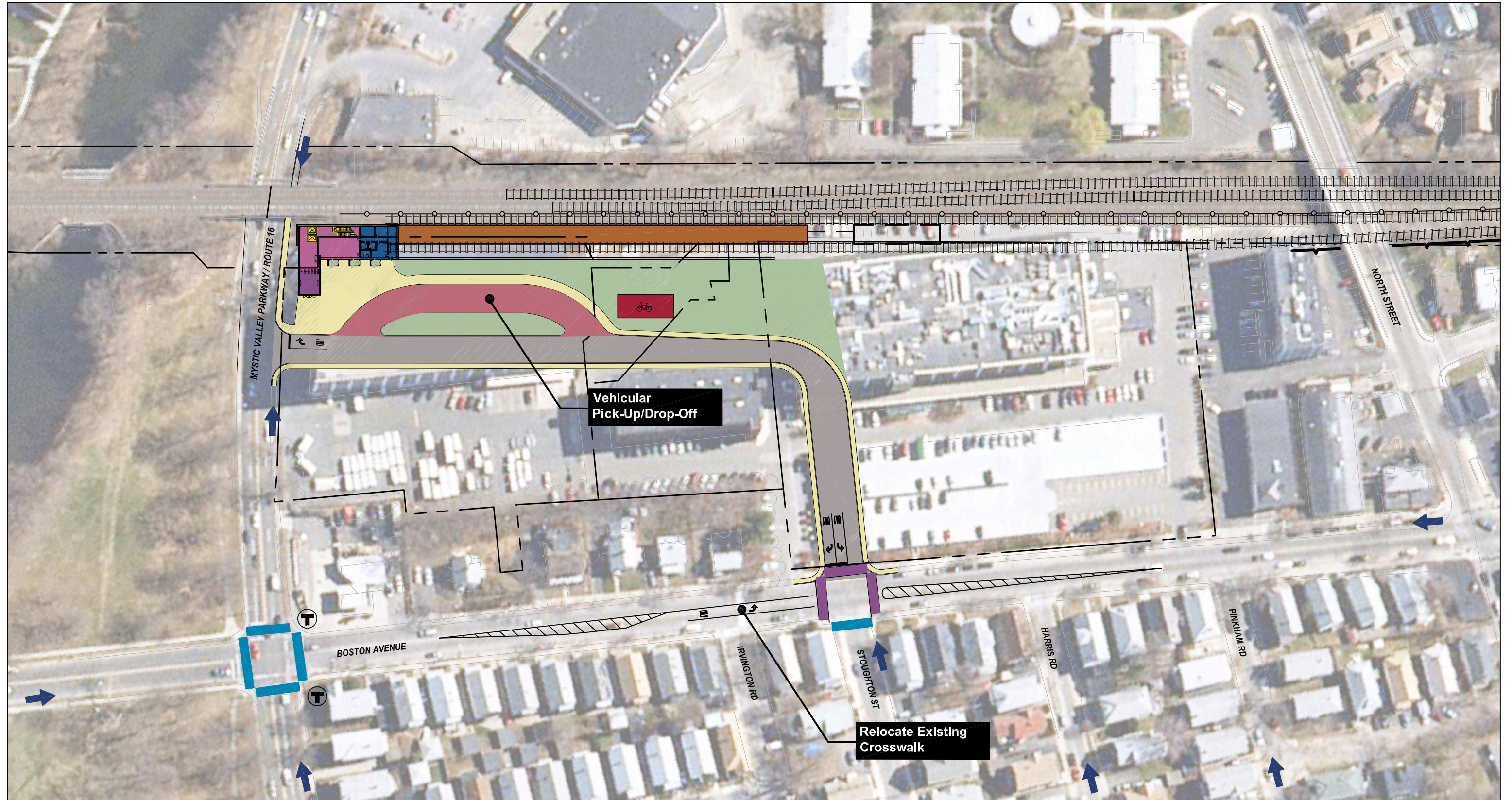
Green Line Extension Project